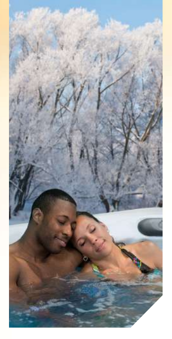
RELAX Your Twilight is a superior energy-efficient hot tub and that means savings for you and your monthly utility bill.