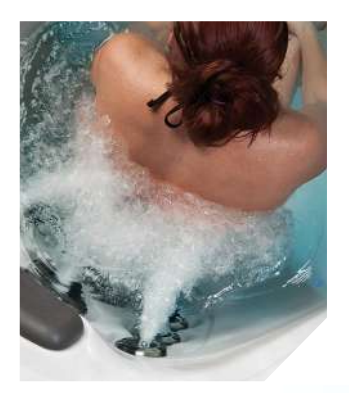
HYDROTHERAPY JETS From the full-body massage, to concentrated neck and shoulder relief, to lounge and cool-down seats, you get the spa experience that's just right for you.