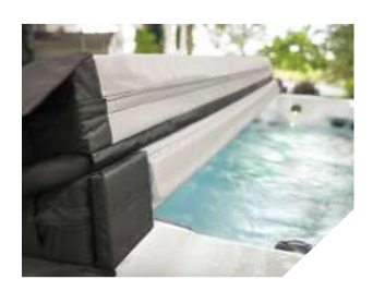
EXCEPTIONAL COVERS Safety, protection, and energy efficiency are key components of our exclusive UL certified covers. Constructed from recycled polyester, our covers are strong enough SSIA to withstand the elements but light enough for easy use.

Environmentally-friendly foam insulation provides a consistent, comfortable temperature inside the hot tub, while cold air is kept outside.