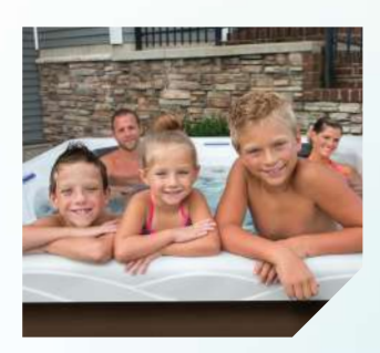
ECOPUR® CHARGE This patentpending filtration system takes the work out of maintaining your hot tub. It relies on a unique blend of copper and zinc that creates an electrochemical reaction to eliminate many microorganisms and remove heavy metals.

MAST3RPLIR<sup>™</sup> WATER MANAGEMENT SYSTEM A synergistic blend of three proven natural water sanitizers combine to make a dramatically more effective water management system. The blend results in clean, clear, fresh smelling and silkier water.*