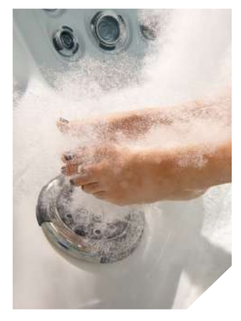
MASTER BLASTER® FOOT THERAPY SYSTEM Treat your feet to soothing, massaging jet action.