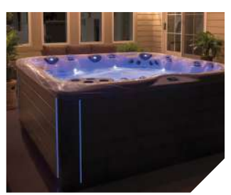
DREAM LIGHTING Beautiful soft streams of light accent the exterior corners of your hot tub at night.

ORION LIGHT SYSTEM<sup>™</sup> LED lights beautifully illuminate the water as well as the cascade waterfall and topside controls.