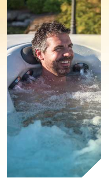
STRESSRELIEF NECK AND SHOULDER SEAT™ Strategically placed jets and magnets provide the ultimate tension relieving therapy.